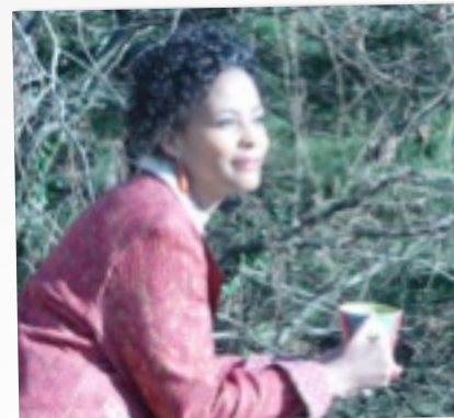
THE SUCCESS EXPERT